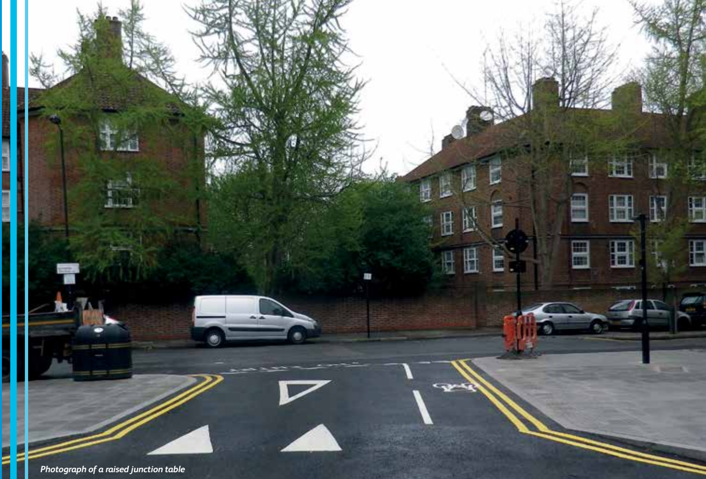
Photograph of a raised junction table